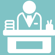
Principal/ Chief Executive