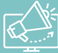
Head of Marketing

In 2023 we completed 106 placements and provided 6000 days of of interim support to 55 Further Education Colleges and Training Providers