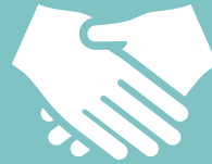
Head of Business Support Department