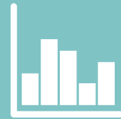
MIS Director/ Manager