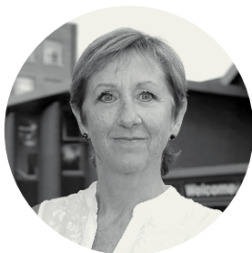
Dame Sally Dicketts DBE