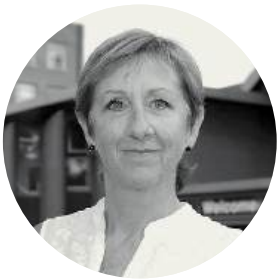
Dame Sally Dicketts DBE