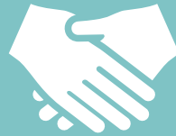
Head of Business Support Department