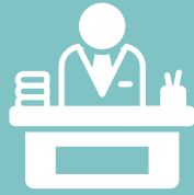
Principal/ Chief Executive