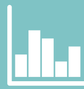
MIS Director/ Manager